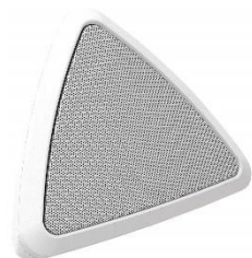
Recalled ION Audio Cornerstone portable speaker