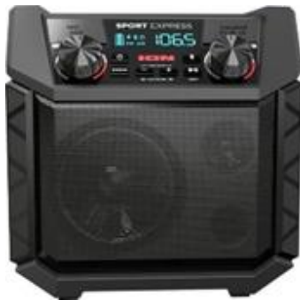
Recalled ION Audio Sport Express portable speaker